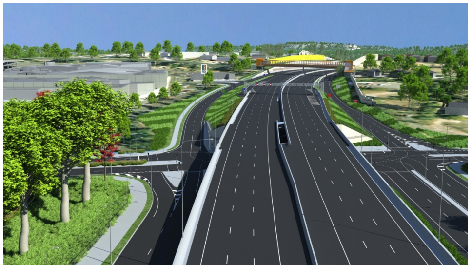
3ds Max Design visualization model.