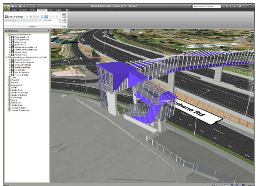
Figure 3: Navisworks 3D model.

— Mark Patis Technical Executive, Design Parsons Brinckerhoff