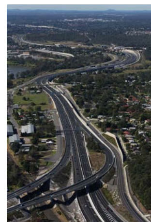
Figure 1: Dinmore to Goodna stretch of the motorway.

eight kilometers of rebuilt motorway (see Figure 1), the project included seven kilometers of new service roads, 25 kilometers of shared pedestrian and bicycle paths, the demolition of 15 existing bridges, and the construction of 26 new bridges. Furthermore, the motorway is adjacent to busy rail lines, residential areas, schools, businesses, and shopping centers. And part of the motorway runs over three abandoned coal mines.